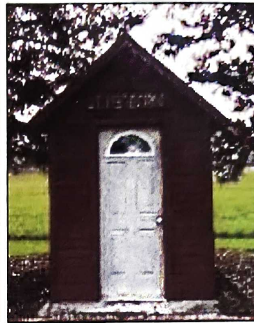
St. Peregrine Chapel