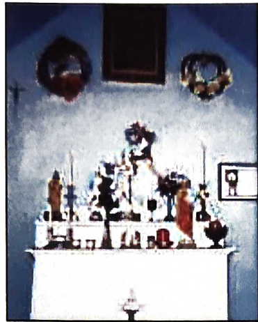
St. Odile Chapel